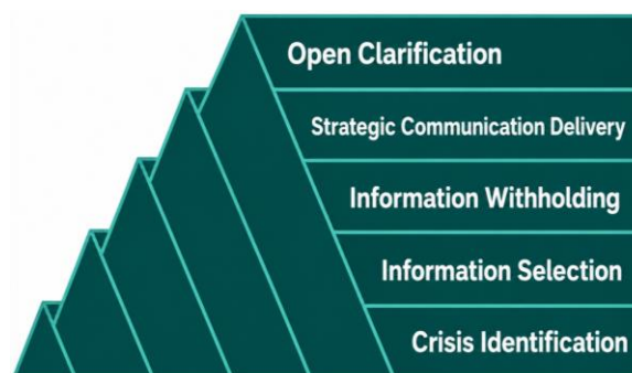
Figure 2. Process of a Silent Communication in Prophetic Values

This practice can be understood through the values of hikmah (wisdom) and prudence, which serve as foundational principles in the decision-making process. From the perspective of prophetic communication, hikmah is not merely understood as wisdom in action, but also as the ability to determine the appropriate message, timing, and mode of communication according to the circumstances at hand. 19 This finding is consistent with the view of Dara Puspita Sari, who argues that prophetic communication emphasizes the importance of ethical considerations in the use of information so that communication does not result in greater harm. 20 Therefore, silent communication during the initial phase of a crisis is positioned as a form of institutional prudence rather than an attempt to evade responsibility.